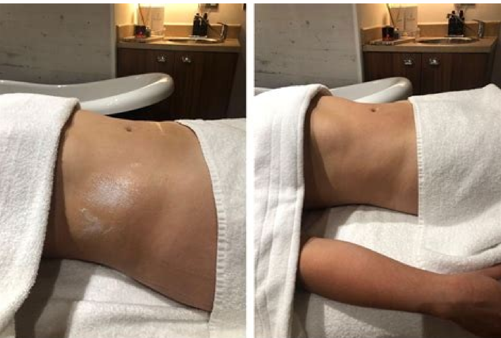
Is massage good for lymphatic drainage.